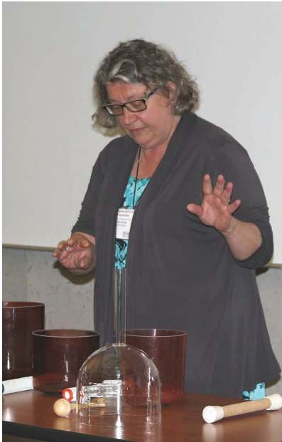
Right: Singing Bowls

Kim also introduced us to singing bowls, enabling us to experience somewhat different vibrations that are also used for healing, meditation and relaxation. Needless to say, at the end of the session we were feeling refreshed and alert—a challenge for anyone giving a presentation to individuals immediately after lunch.