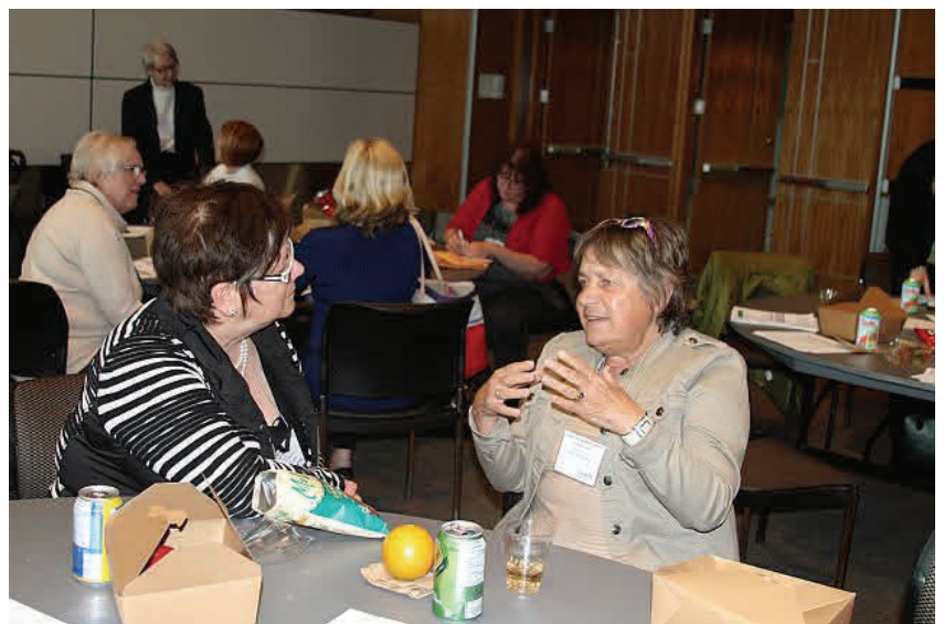
Networking and Connecting

Watch for news of the next symposium scheduled for May 2016